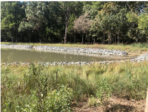
Living shoreline on Wind Rush Farm in Royal Oak.