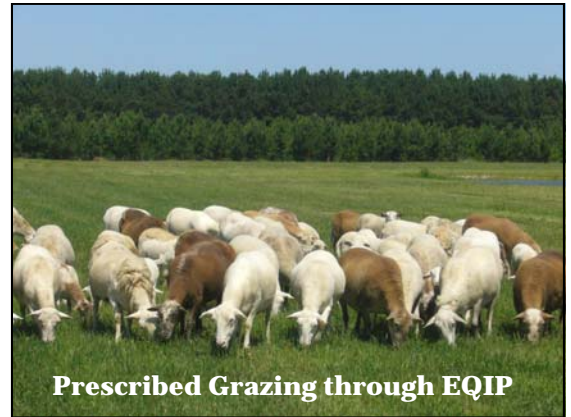
Prescribed Grazing through EQIP