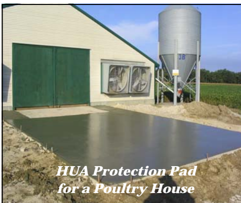
HUA Protection Pad for a Poultry House

* Must have a minimum of 8 animal units already on pasture ** Indicates a new conservation practice for EQIP in 2008