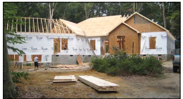
The new house currently being built in Cordova, MD.

They wanted to sincerely thank everyone for their thoughts and prayers as they continue to adjust following the devastating fire.