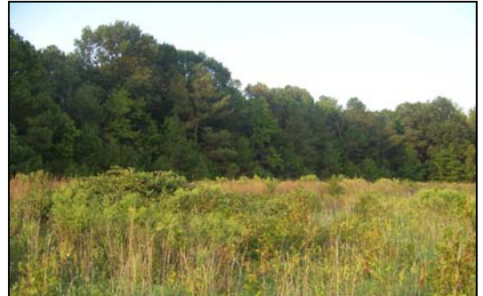
CRP filter strip properly maintained